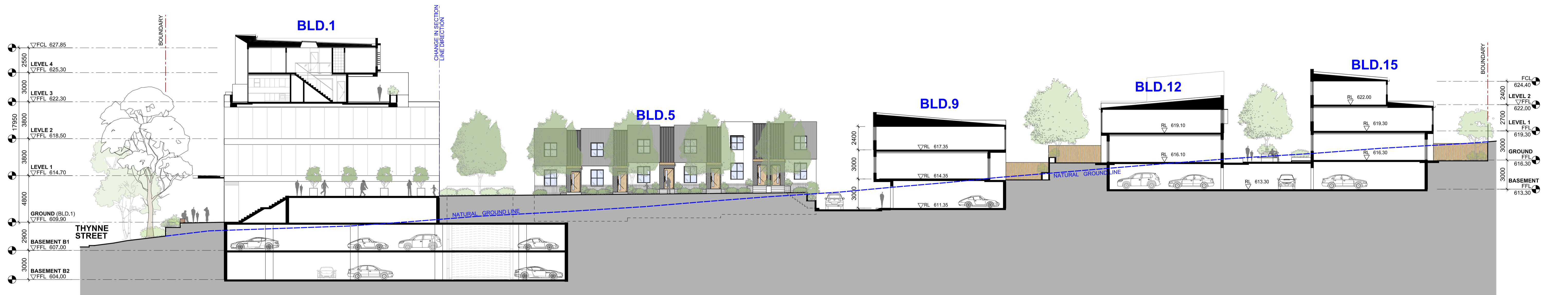
1. SECTION A.A